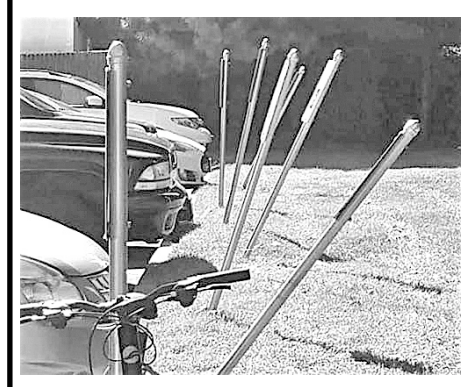
Parking lot in front of the Eye Surgery Centre

"The only way to keep your health is to eat what you don't want, drink what you don't like and do what you'd rather not" Mark Twain